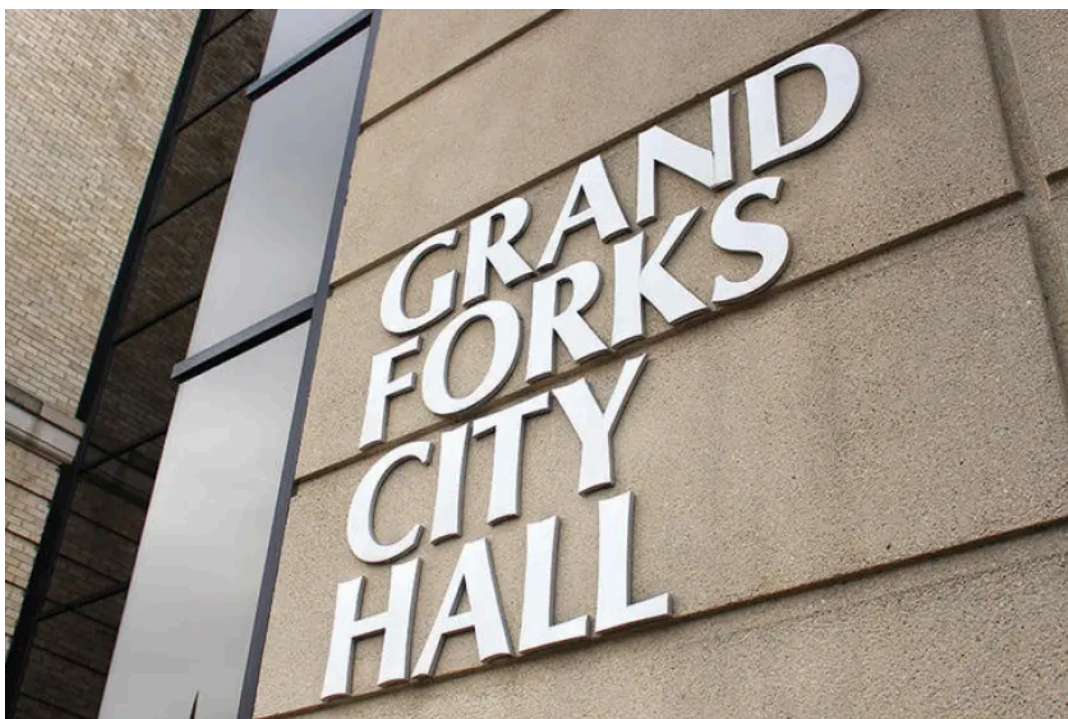
Grand Forks City Hall, 255 N. 4th St.

The Grand Forks Children's Museum is considering locating near the new complex, which could bring infrastructure savings to the city.